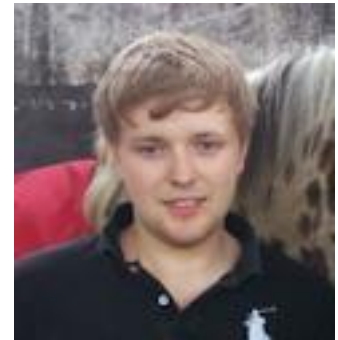
✗ Wrong dimensions