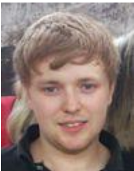
✓ Image acceptable