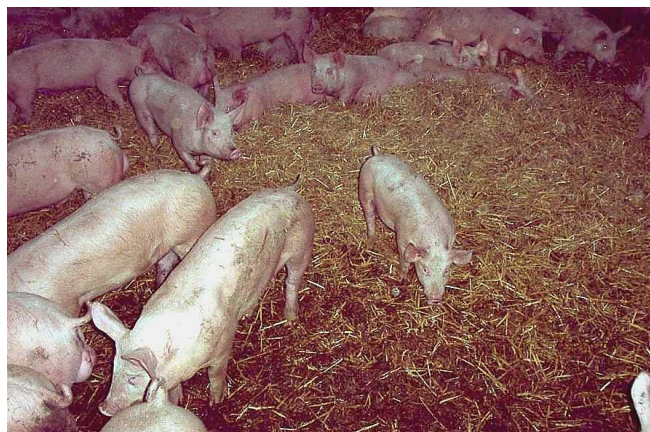
Image 3. Is it or isn't it? Grower pigs with diarrhoea in a straw court- always discuss outbreaks with your vet.

Pigs at the top end of the dysentery severity scale have bloody diarrhoea but it takes a while for them to reach that level of severity and in the meantime infection could spread unabated among pigs, possibly also to other sites if the diarrhoea is ignored or considered to be unimportant ( Image 3 ). Outbreaks of diarrhoea should be discussed with your vet and investigated without delay to establish the cause and if it is dysentery, the quicker it is diagnosed, the sooner it can be controlled and the disease impact minimised.