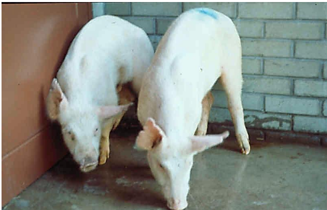
Image 2. Grower pigs suffering effects of Swine dysentery

clumps on mucus on the surface. There might be reasonably fresh-looking blood in the faeces and in the worst cases, severe bloody diarrhoea. Such pigs look obviously ill – tend to lie to the sides of the pen, be unwilling to rise, might have slightly 'flushed-looking' skin colour and be slab-sided and 'empty' looking through the combination of poor appetite and diarrhoea. (Image 2) Badly affected pigs can die from swine dysentery. Adult pigs can get dysentery and show similar clinical signs but it is rarely fatal.