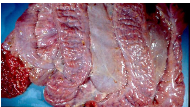
Image 1. Haemorrhagic Colon from pig with Swine dysentery

Caused by a bacterial infection called Brachyspira hyodysenteriae , the organism has a snake-like shape and moves through intestinal content seeking out its perfect habitat – the large intestine of pigs, specifically liking the glands or crypts of the colon. The bacteria swim into the glands and cause inflammation of the lining of the colon. As part of the response to infection, the colon increases the amount of mucus material produced by cells, so once the infection is well-established in the pig, mucus can be seen in the faeces passed by pigs. Severe infections cause the colon lining to bleed (Image 1) leading to blood being present in the faeces.